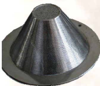
Rigid Screen 0.7 mm